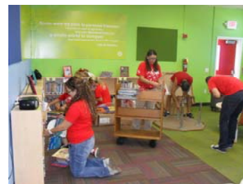
Target volunteers setting-up the Library.

Nationwide, Target is on track to give $1 billion for education, with a focus on reading, by the end of 2015.