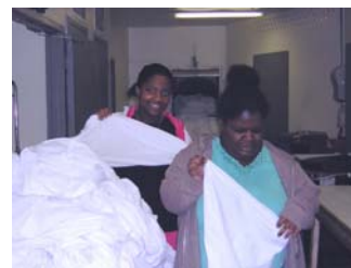
CBI students work in the laundry room.

With the CBI Program as the start of the partnership, El Palacio has also generously donated hygiene supplies, work clothing, food and items for fundraisers for the past two school years. They participate in school functions and recently served as a judge for the Harvest Fest. Two months ago, El Palacio hired one of the CBI students and they continue to mentor him to help him reach his full potential.