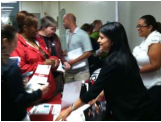
Deerfield Beach High teachers enjoying the first Teacher Appreciation Day

Deerfield Beach High School would like to thank BB&T Bank, VALIC Financial Advisors, Keiser University, Johnson & Wales University, L & S Insurance and The U. S. Army for their participation in the first Buck Pride - Partners In Education Expo & Teacher Appreciation Breakfast held on October 28, 2011 in the school's ProStart Café.