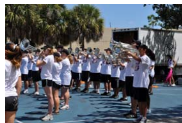
The Marjorie Stoneman Douglas High School Eagle Regiment performs.