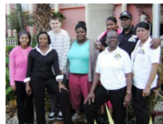
CBI students take a picture break with El Palacio staff.