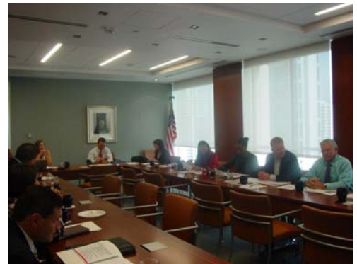
PIE Directors at the Annual Planning Meeting held at Holland & Knight offices on Las Olas

On July 8, directors will meet again to hone ideas into strategies, tactics and action steps for the 2011-2012 school year.